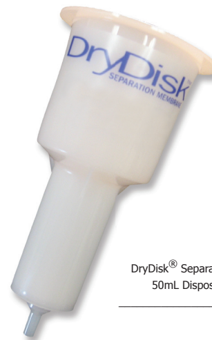
DryDisk® Separation Membrane 50mL Disposable Barrel

enquiries@arcsciences.com www.arcsciences.com