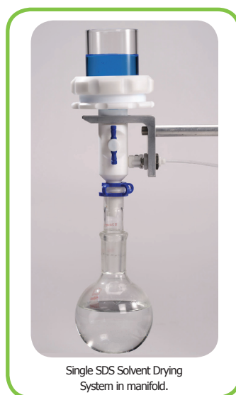
Single SDS Solvent Drying System in manifold.