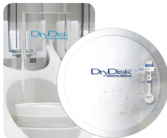
The DryDisk™ Separation Membrane - 65mm hydrophobic membrane is for use with the Horizon Technology DryVap® Concentrator System or SDS Solvent Drying System.